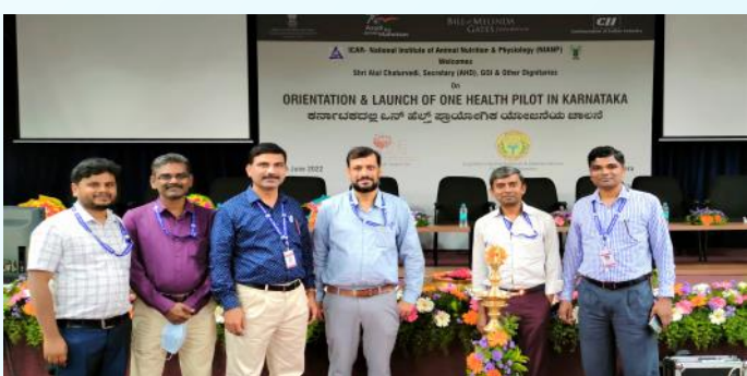
ICAR-NIVEDI Scientists participated in the orientation and launch of One Health Pilot programme held at IC-AR NIANP, Bengaluru on 28<sup>th</sup> June 2022.