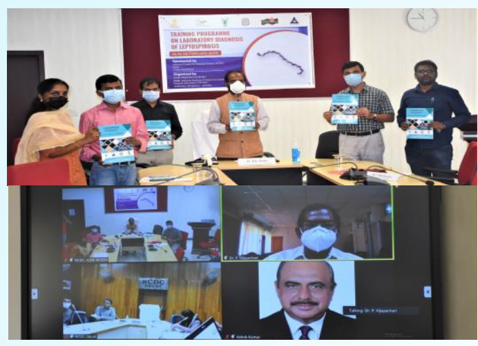
NCDC sponsored training programme on Laboratory diagnosis of Leptospirosis for the benefit of laboratory personnel involved in Leptospirosis diagnosis organized at ICAR-NIVEDI during 1-5<sup>th</sup> February 2022.