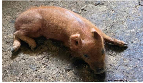
Hindlimb paralysis in pigs

clear need for additional research to comprehend the broader implications of this virus within the district's and state's pig farming communities.