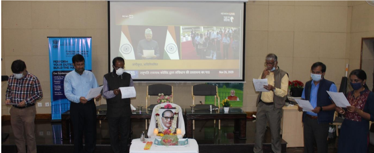
Reading of “Preamble” of the Constitution of India with the Hon’ble Shri Ramnath Kovind ji, President of India