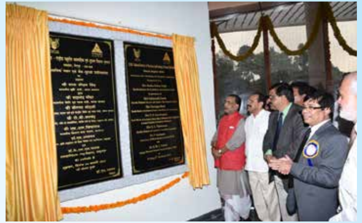
Unveiling the inauguration plaque of Administrative building and Biosafety Laboratory, NIVEDI by Shri Radha Mohan Singh ji, in the presence of other dignitaries.