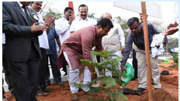
Plantation of tree sapling by the dignitaries.