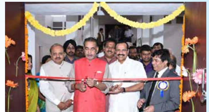
Biosafety Laboratory (BSL-2) dedication to nation by Shri Radha Mohan Singh ji, in the presence of other dignitaries.