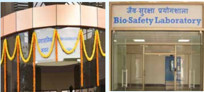
The panoramic view of NIVEDI Administrative Building and Biosafety Laboratory.