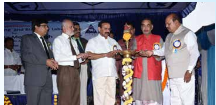
Lighting of the lamp by Shri Radha Mohan Singh, Hon'ble Union Minister for Agriculture, New Delhi and other dignitaries on the occasion of inaugural function.