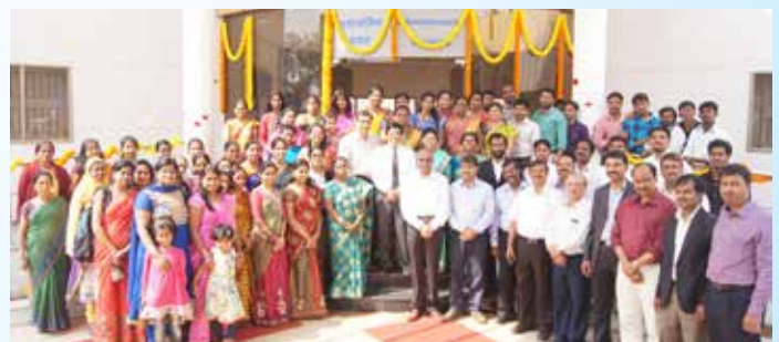
Best wishes from NIVEDI Family