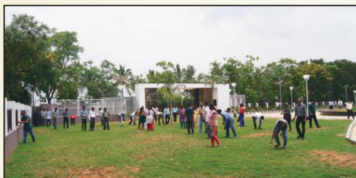
As a part of Swacchh Bharat Mission, cleanliness drive was organized at ICAR-NIVEDI campus during 22-28 th July, 2015.