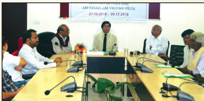
Farmers-Scientists Interaction meet was organised at ICAR-NIVEDI as part of Jai Kisan Jai Vigyan week celebration on 29 th December, 2015.