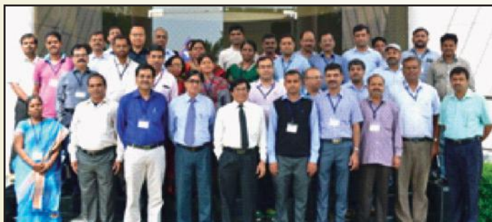
ICAR-NIVEDI organized Model Training Course on Epidemiology and Impact Assessment of Livestock diseases: concepts, application and strategies sponsored by Directorate of Extension, Ministry of Agriculture and Farmers Welfare, Government of India, New Delhi during 14-21 st December, 2015.