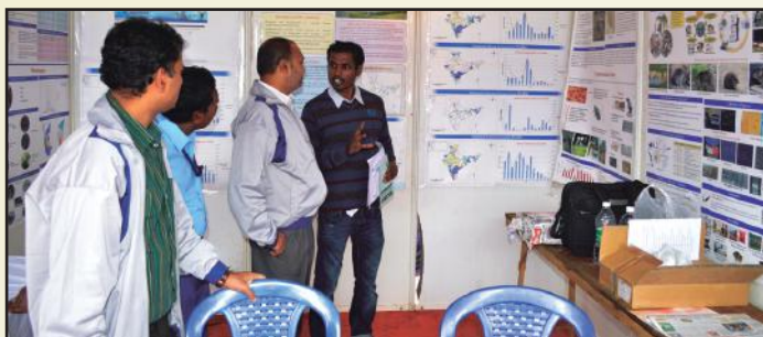
ICAR-NIVEDI, participated in the Krishimela organized at UAS, GKVK, Bengaluru during 19-22 nd November, 2015 and exhibited the technologies for the benefit of farmers and other stakeholders.