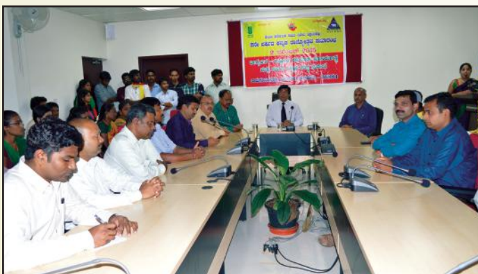
Kannada Rajotsava was celebrated on 2 nd November, 2015 at ICAR-NIVEDI and various competitions were organized during the occasion.